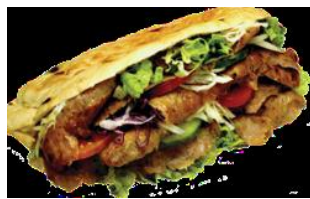
d. Döner Kebab